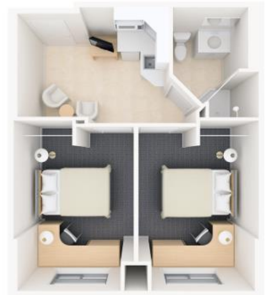
South Village Residence

Disclaimer: Suite may not be exactly as shown