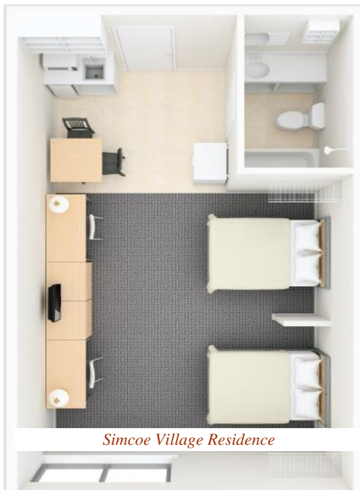
Simcoe Village Residence

Disclaimer: Suite may not be exactly as shown